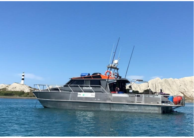
Figure 3: LINZ HSS57 Kaikoura Survey, common survey area & shared resources