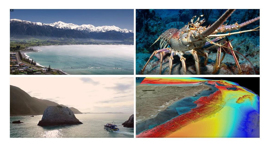
Figure 1: Multiple stakeholders, multiple deliverables; Community, fisheries, tourism, safety of navigation

It goes without saying that the key to any successful project starts with a clear and concise project brief. In the case of complex nautical charting surveys, the brief should establish clear questions for the contractor to answer, whether they relate to safety of navigation or science. It's important for the contractor to understand what must be achieved, what elements are critical and why, what specific deliverables are required, when they are required and in what form. Defining the question also ensures that deliverables will be fit for purpose for all stakeholders.